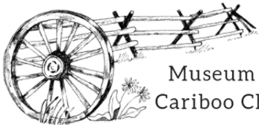
Museum of the Cariboo Chilcotin

While increased Covid-19 restrictions put a halt to our Annual General Meeting, scheduled for past November, we are still looking forward to updating our Members with the successes of our museum over the past year. While 2020 was challenging for everyone in our community and across the globe, we still accomplished many exciting projects and saw many positive outcomes and opportunities. We have rescheduled our AGM for May 20th, 2021. We will be in communication closer to the date with further details, including location, which will be determined following Covid-19 regulations. Please mark our AGM on your calendar!