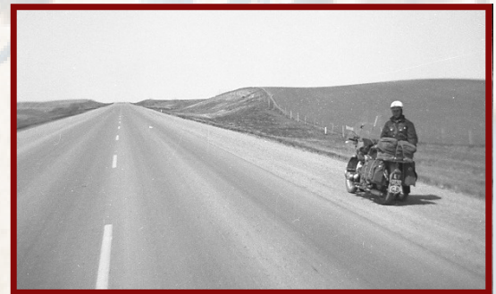
Ed stands with the motorcycle as they travel across prairies