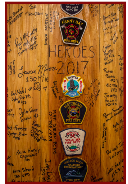
2017 Logs Signed by First Responders - Donated for exhibit use by Pioneer Log Homes