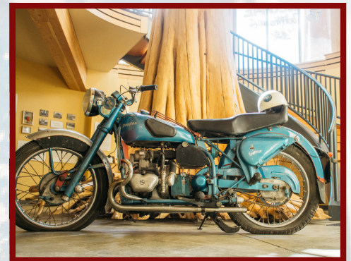
1951 MkV Douglas Motorcycle